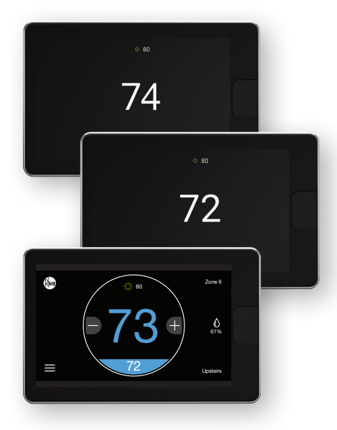
EcoNet Zone Control RECTL700ZON